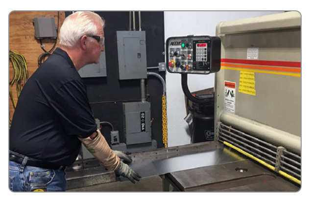
On-site shearing is available as well