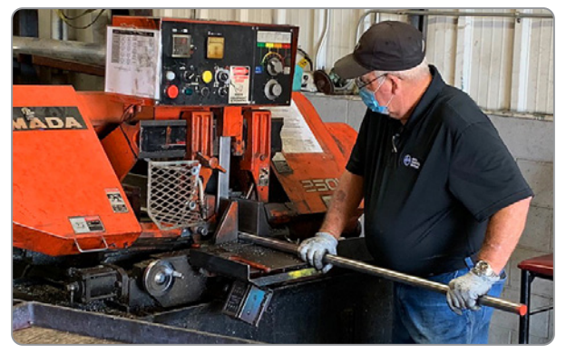
We offer cut-to-size saw cutting