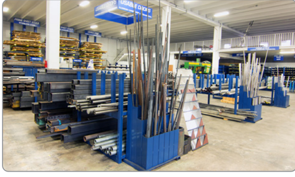
We stock a large selection of carbon steel, aluminum, copper, tool steel, stainless steel, brass and bronze